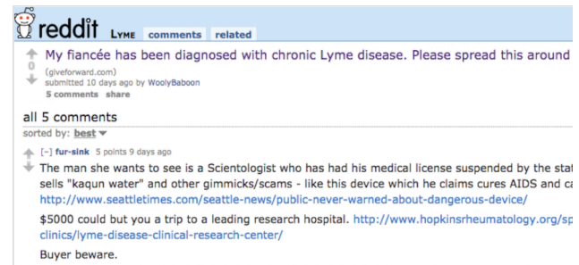
Figure 2. An example of a Reddit post: clicking the Reddit post's title redirects users to a corresponding campaign page on a medical crowdfunding site. The comment shown in the figure questions the credibility of the campaign.

pursue their project ideas. Many researchers have identified factors that lead to success of entrepreneur crowdfunding. Inclusion of a video in the campaign description [21], project updates [32], and the size of the fundraiser's personal network [24] increased the likelihood of reaching a funding goal. Reward structures were also associated with campaign success [12,20]. Specifically, the principle of reciprocity, whereby people receive tangible artifacts in exchange for donations, significantly impacted the success of campaigns [20]. Also, fundraisers changed their reward strategy after a failed campaign by reducing the number of reward levels [12]. Finally, recent entrepreneur crowdfunding credibility perception research suggests emphasizing professionalism [17], experience [6], and past success in campaigns [30].